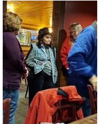
On Tuesday January 16<sup>th</sup> our group braved the cold and went to Perkins in Cloquet for fellowship and dinner!