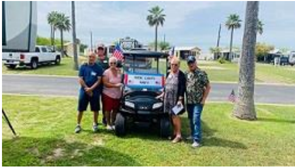
Here are some friends who were helpful in pulling this off without Rick knowing about it