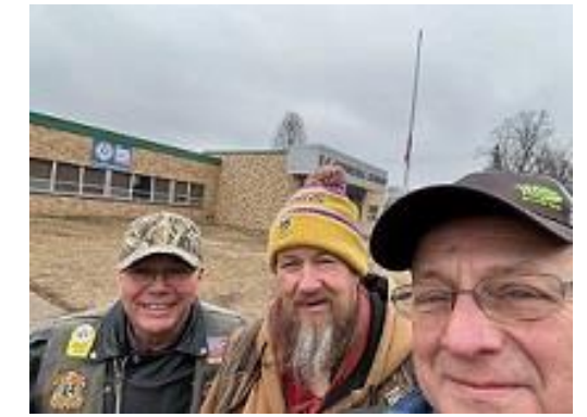
They made sure to pray for our Hospital and all those who care for our community