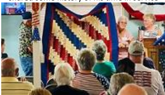
They wrap the quilt then around the veteran's shoulders