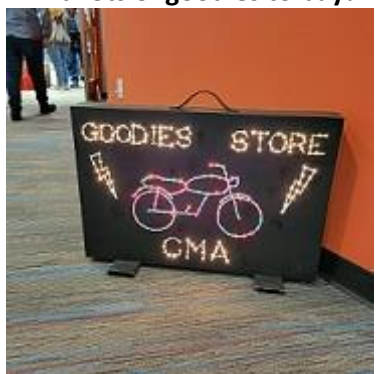
And Our goodie Reps showed off some new items!