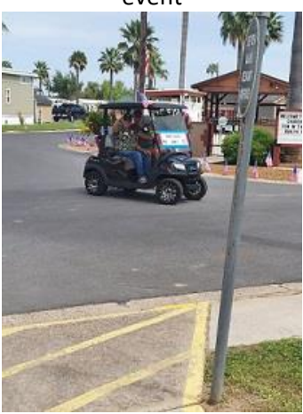
The local Patriot Guards gave lead them all through the park