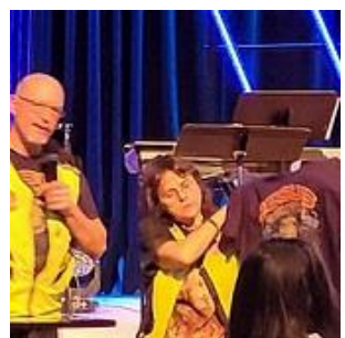
And some great music by the CMA band!