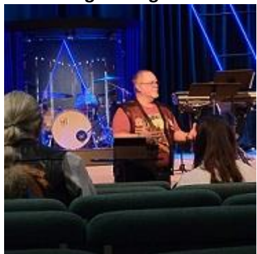
And lots of goodies to buy!