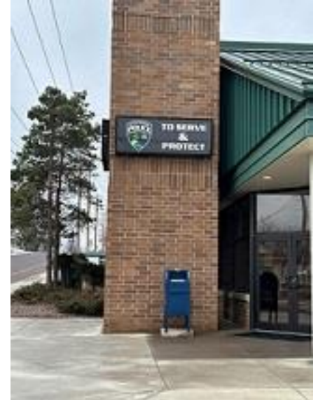
A stop for prayer for our Firefighters!