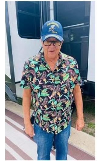
All the veterans Honored were escorted to the event