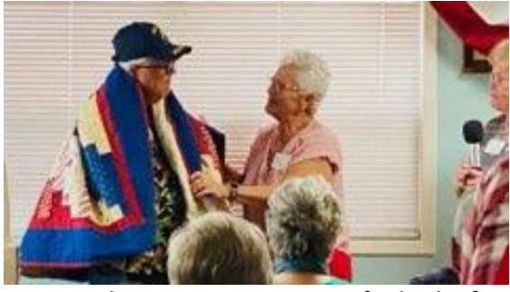
It was truly a moving experience for both of us