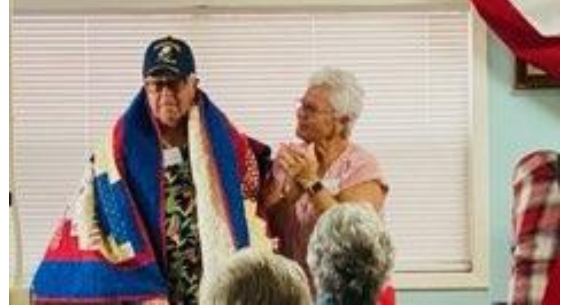
8 Veterans were honored