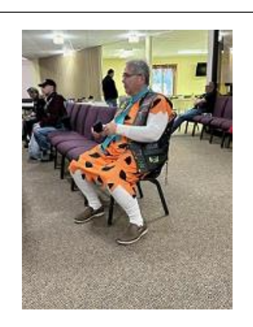
A short prayer before the festivities begin!